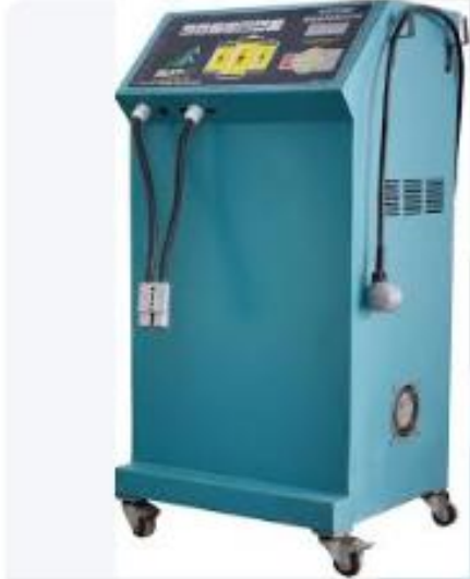
Lead acid battery regeneration